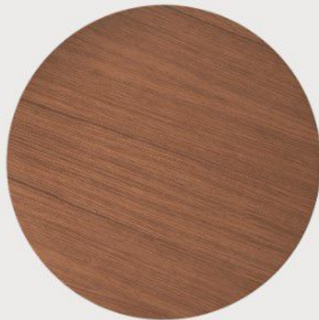
Oiled dark oak