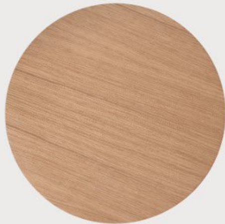
Oiled natural oak