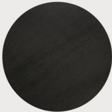
Lacquered matt black

We finish our products with an eco-friendly water-based lacquer, creating a safe and environmentally responsible coating.