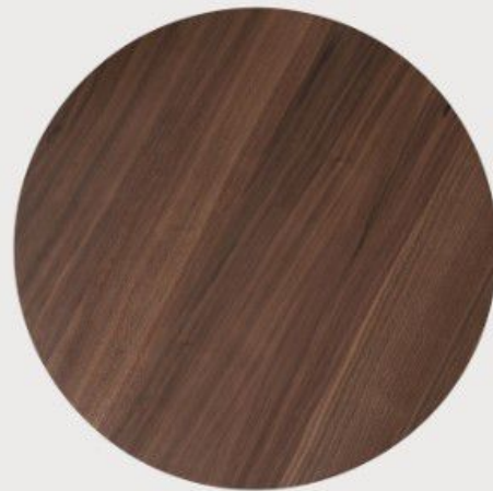
Oiled natural walnut