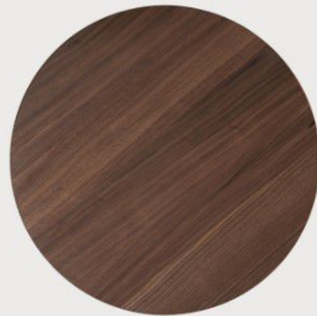
Lacquered matt walnut