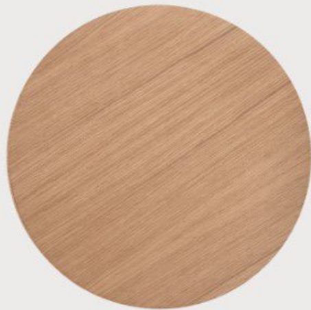
Lacquered matt oak