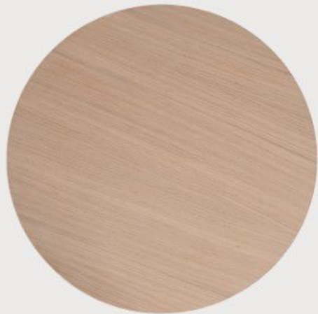
Oiled light oak

We protect our furniture with hard wax oil by OSMO, which protects against the penetration of dirt, water and stains. Product based on natural vegetable oils and waxes. We use oak and walnut veneers.